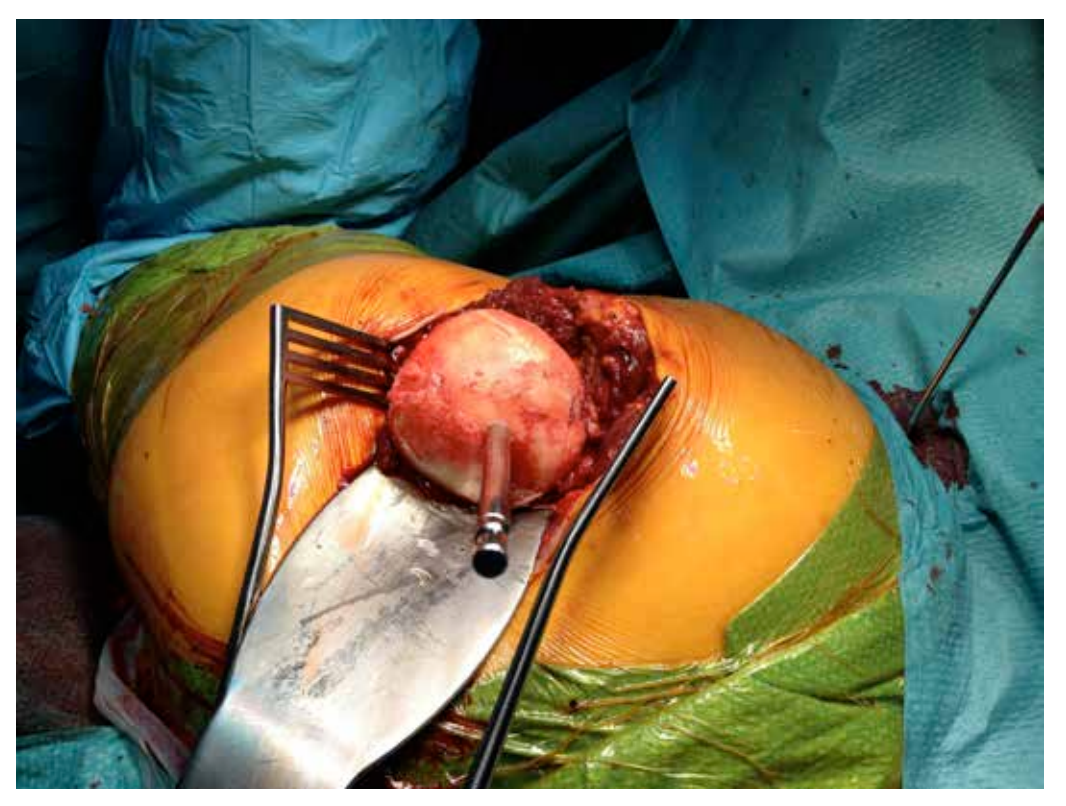
BHR in Perthes' disease: Pin in mushroom shaped femoral head.