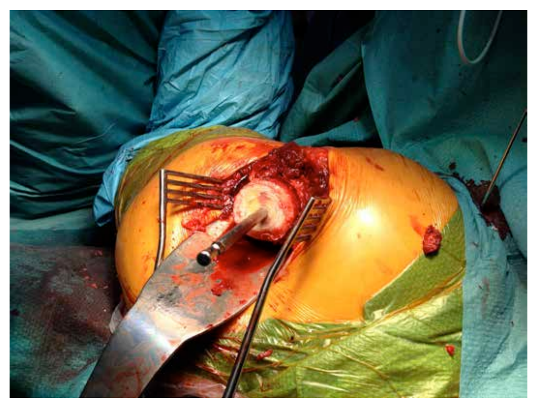
BHR in Perthes' disease: Minimal planing of zenith of head to try to preserve as much bone as possible to try to increase leg length.