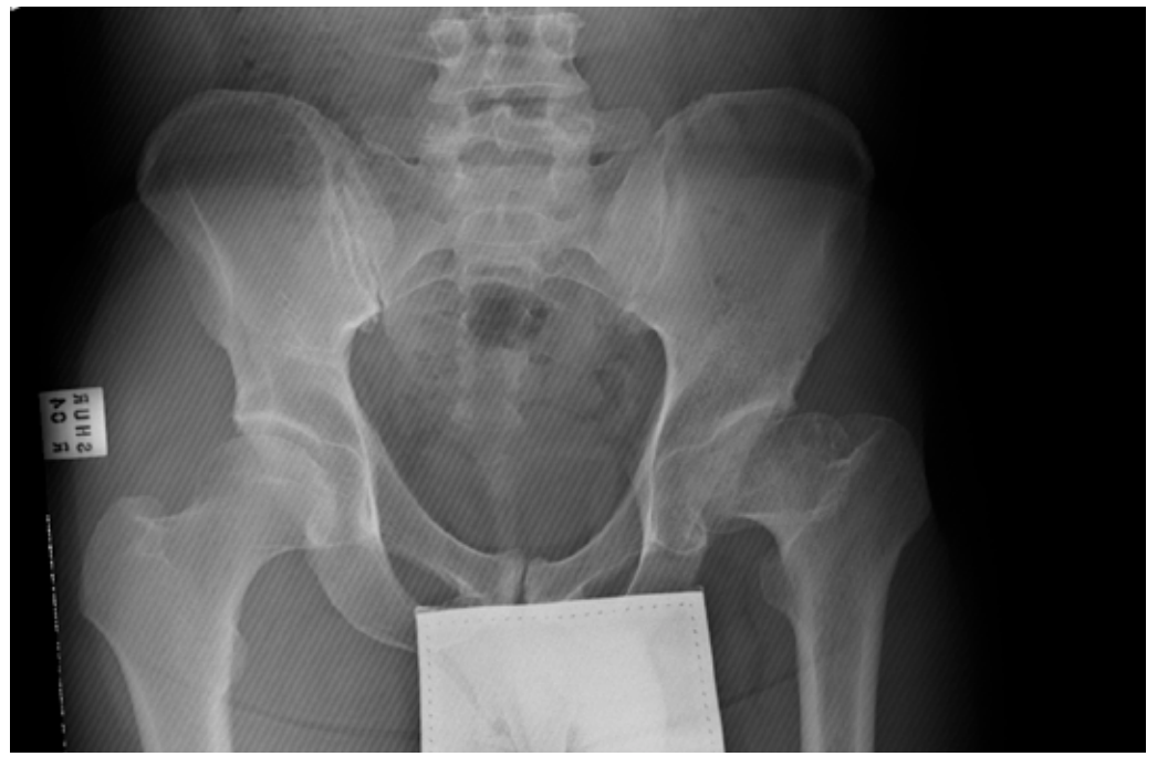
X-ray shows typical post-Perthes' deformity with a large 'mushroom shaped' femoral head, short femoral neck, short leg, and, in this case, shallow acetabular socket.