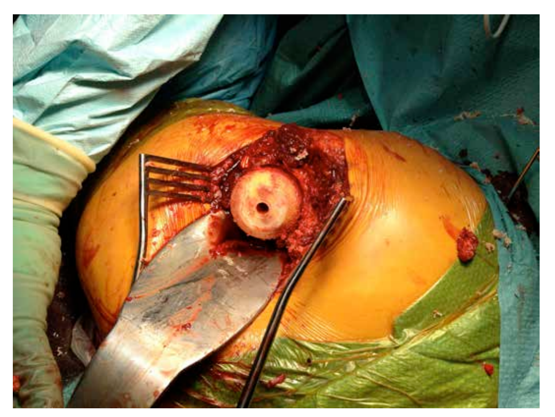
BHR in Perthes' disease: Final appearance of bone before resurfacing component is placed. The bone qulaity is excellent in this case.