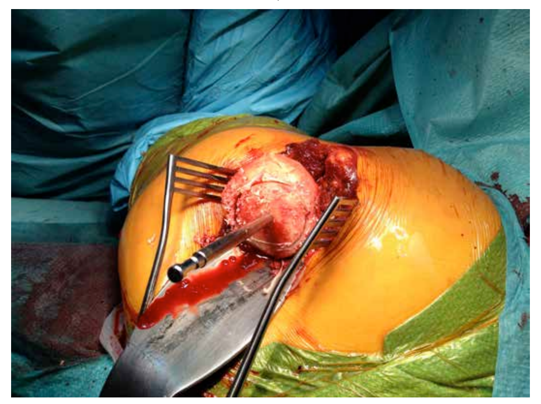
BHR in Perthes' disease: Cylinder cutter removes more bone then in osteoarthritis from the mushroom-shaped head.