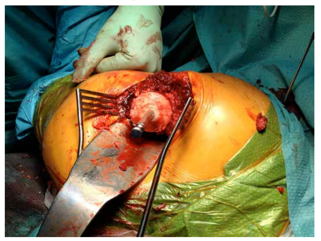
BHR in Perthes' disease: After cylindrical cut and removal of bone, head is cylindrical.