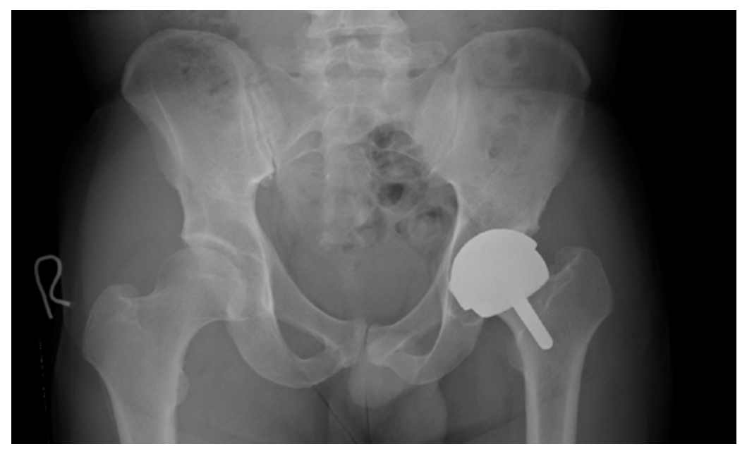
BHR in Perthes' disease: Post operative X-ray shows optimally postioned BHR implants, but the length has not been improved. Outcome was excellent: the patient was able to return to unrestricted sport, and was not concerned by the short leg. He as very happy.